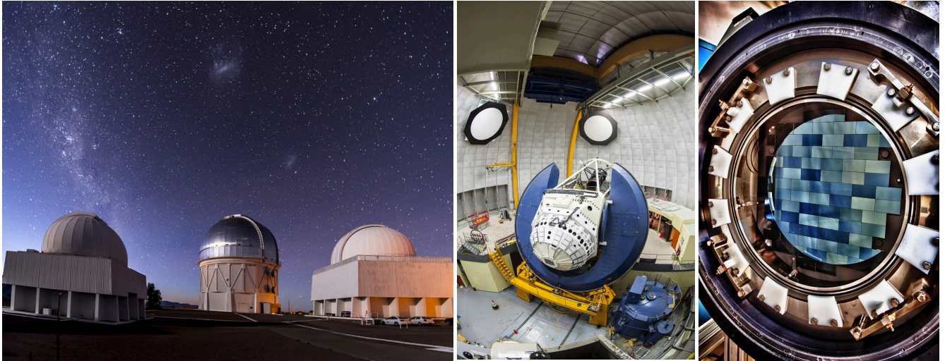
Figure 3: Left: The Cerro Tololo Interamerican Observatory (CTIO) in the Chilean Andes. Center: The Victor M. Blanco telescope, with a 4m diameter mirror. It is located inside the silver dome of the central building pictured on the left. Right: Focal plane of DECam (Dark Energy Camera). It contains 62 ultra-sensitive CCD sensors specially designed for the DES project, and allows imaging of the universe with unprecedented depth. Image credit: DOE/FNAL/DECam/R. Hahn/CTIO/NOIRLab/NSF/AURA. They are publicly available at https://noirlab.edu/public/es/images/ .